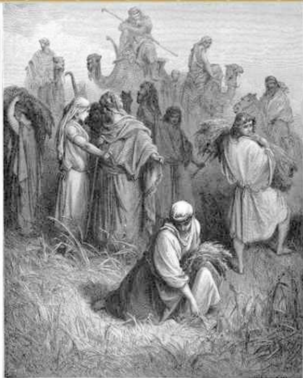
BOAZ AND RUTH

At the seventh day, when the heart of the king was angry with her, he commanded the women And he said . . . to bring Vashti the queen . . . to show the people and the princes her beauty. (Ester's 1, 10, 11) (1:10)