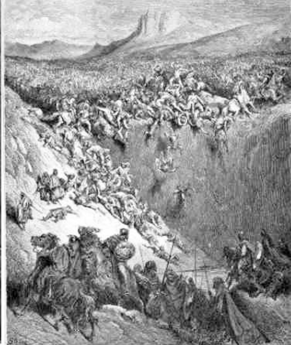
SAMSON DESTROYING THE PHILISTINES WITH THE JAWBONE OF AN ASS

And it came to pass, when she pressed him daily with her words, . . . he told her These locks are come a down upon my head; for I have been a Nazirite unto God from my mother's womb: if I be shaven, then my strength will go from me. (Judges 16: 16-17) [40-41]