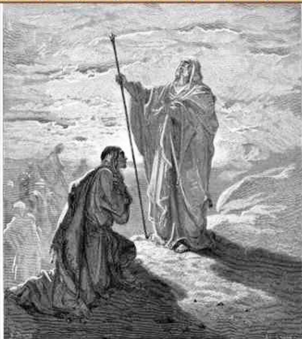
SAMUEL BLESSING SAUL

And when Samuel saw Saul, the Lord said unto him, Behold! the man whom I speak to thee of: this same shall reign over my people. (1 Samuel 9: 15)