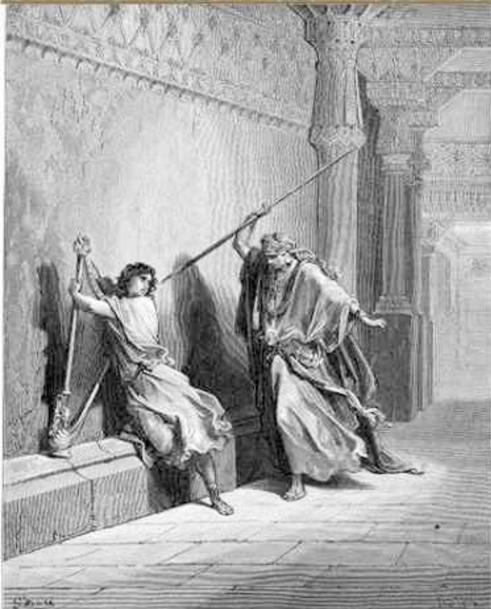
SAUL ATTEMPTS THE LIFE OF DAVID

And Saul cast the javelin, but he said, I will smite David even to the wall with it. — 1 Samuel 16:19. (P. 16)