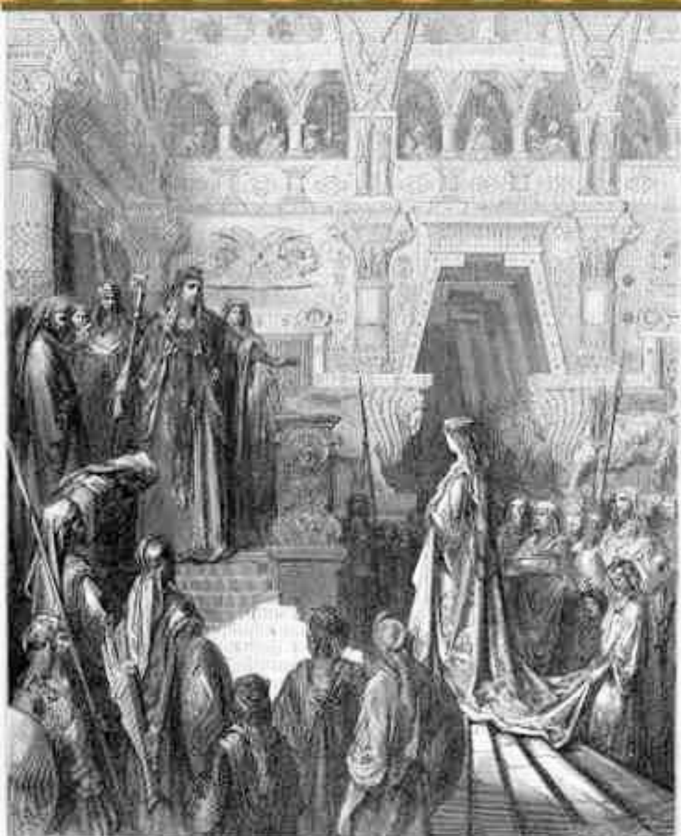
SOLOMON RECEIVING THE QUEEN OF SHEBA

And when the Queen of Sheba heard of the fame of Solomon, she came to Jerusalem, with a very great company, and camels that bare spices, and gold in plates, and precious stones. (1 Kings 10:1-10)