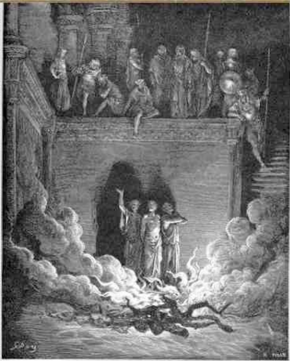
SHADRACH, MESHACH, AND ABED-NEGO IN THE FIERY FURNACE.

And Saul cast the javelin, but he said, I will smite David even to the wall with it. — 1 Samuel 16:19. (P. 16)