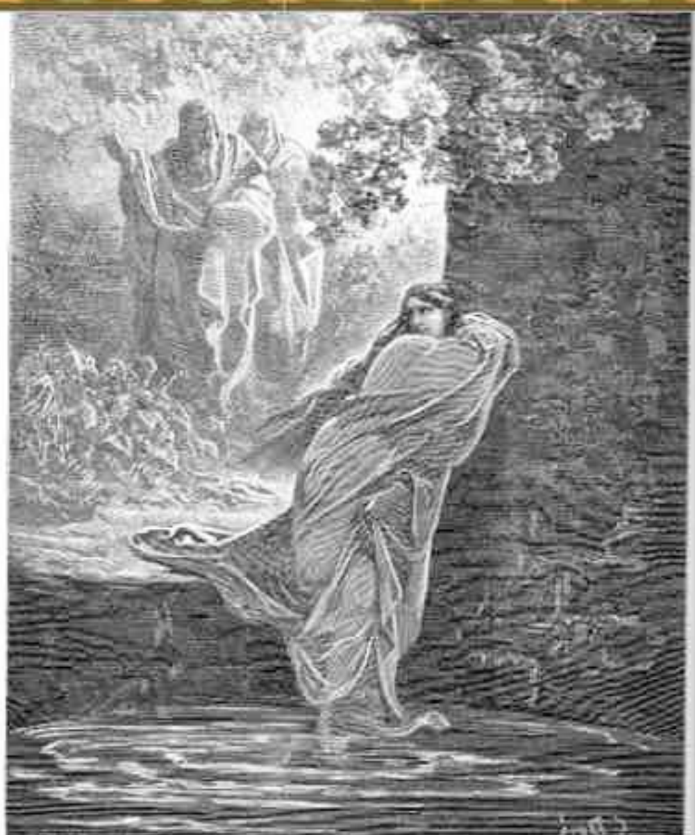
SUSANNA IN THE BATH

And when the Queen of Sheba heard of the fame of Solomon, she came to Jerusalem, with a very great company, and camels that bare spices, and gold in plates, and precious stones. (1 Kings 10:1-10)