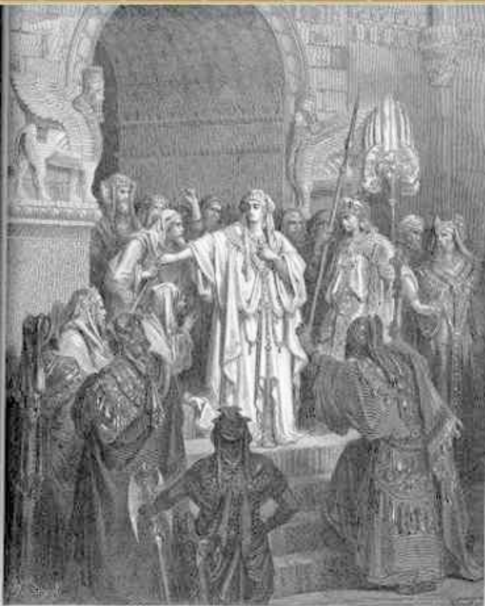
THE QUEEN VASHTI REFUSING TO OBEY THE COMMAND OF AHAHUSERUS

At the seventh day, when the heart of the king was angry with her, he commanded the women And he said . . . to bring Vashti the queen . . . to show the people and the princes her beauty. (Ester's 1, 10, 11) (1:10)