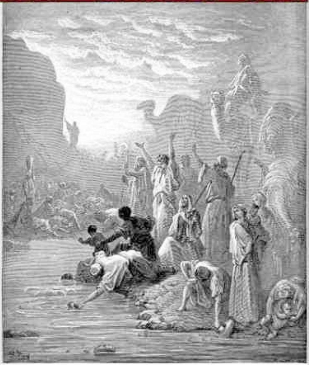
MOSES STRIKING THE ROCK IN HOREB

And the Lord said unto Moses, Go on before the people, and take with thee . . . thy rod. Behold, I will stand before thee upon the rock in Horeb, and thou shalt smite the rock, and there shall come water out of it. And Moses did so in the sight of the children of Israel. . . (Exodus 17: 9, 10)