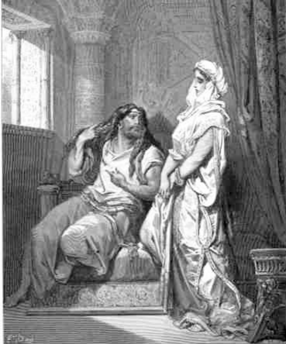
SAMSON AND DELILAH

And it came to pass, when she pressed him daily with her words, . . . he told her These locks are come a down upon my head; for I have been a Nazirite unto God from my mother's womb: if I be shaven, then my strength will go from me. (Judges 16: 16-17) [40-41]