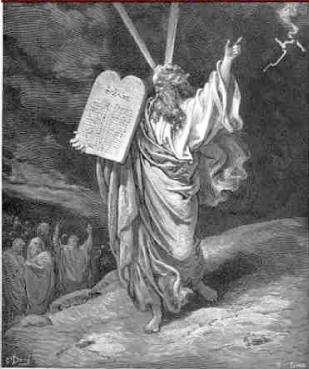
MOSES COMING DOWN FROM MOUNT SINAI

And Moses turned, and went down from the mount, and the two tables of the covenant were in his hand. And the tables were the work of God. . . (Exodus 31: 18, 19)