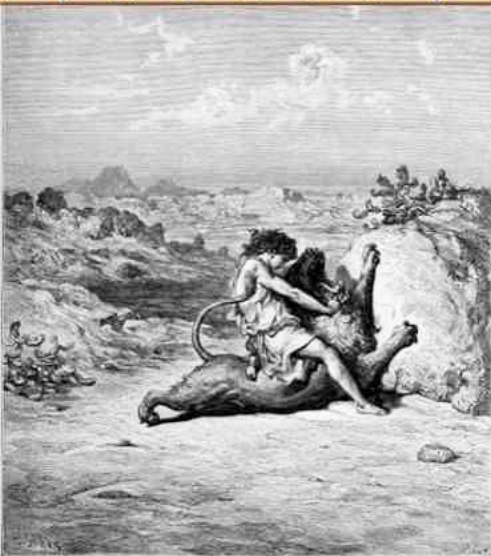
SAMSON SLAYING A LION

Paul beheld, a young lion, crouched against him. And the Spirit of the Lord came mightily upon him, and he cast him as he would have done a kid, and he laid nothing in his hand. And he told not his father or the mother what he had done.