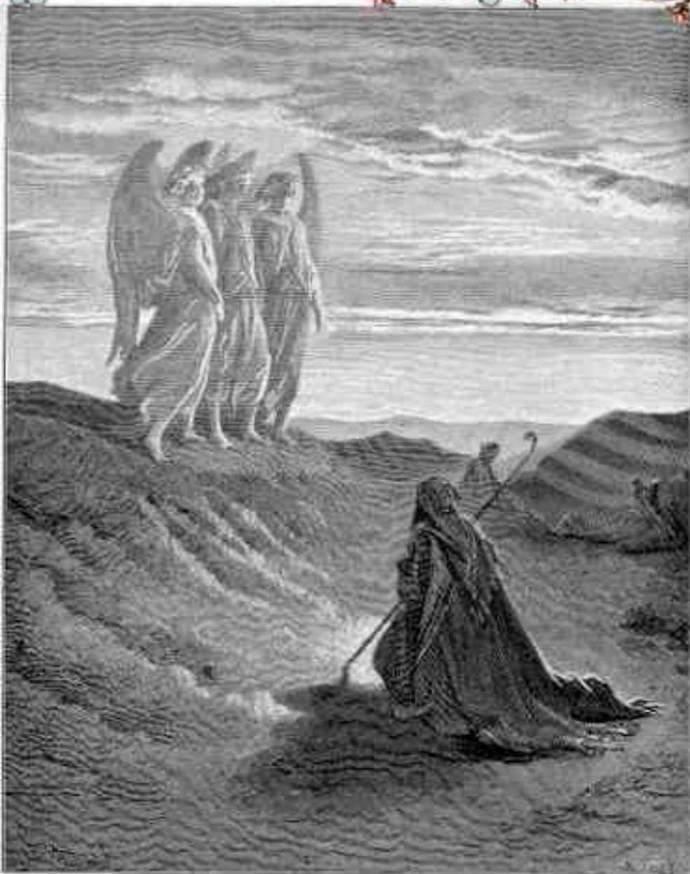
ABRAHAM AND THE THREE ANGELS

And they said unto him, Where is Sarah thy wife? ... Sarah thy wife shall have a son ... Genesis 18:9,10 (18:1)