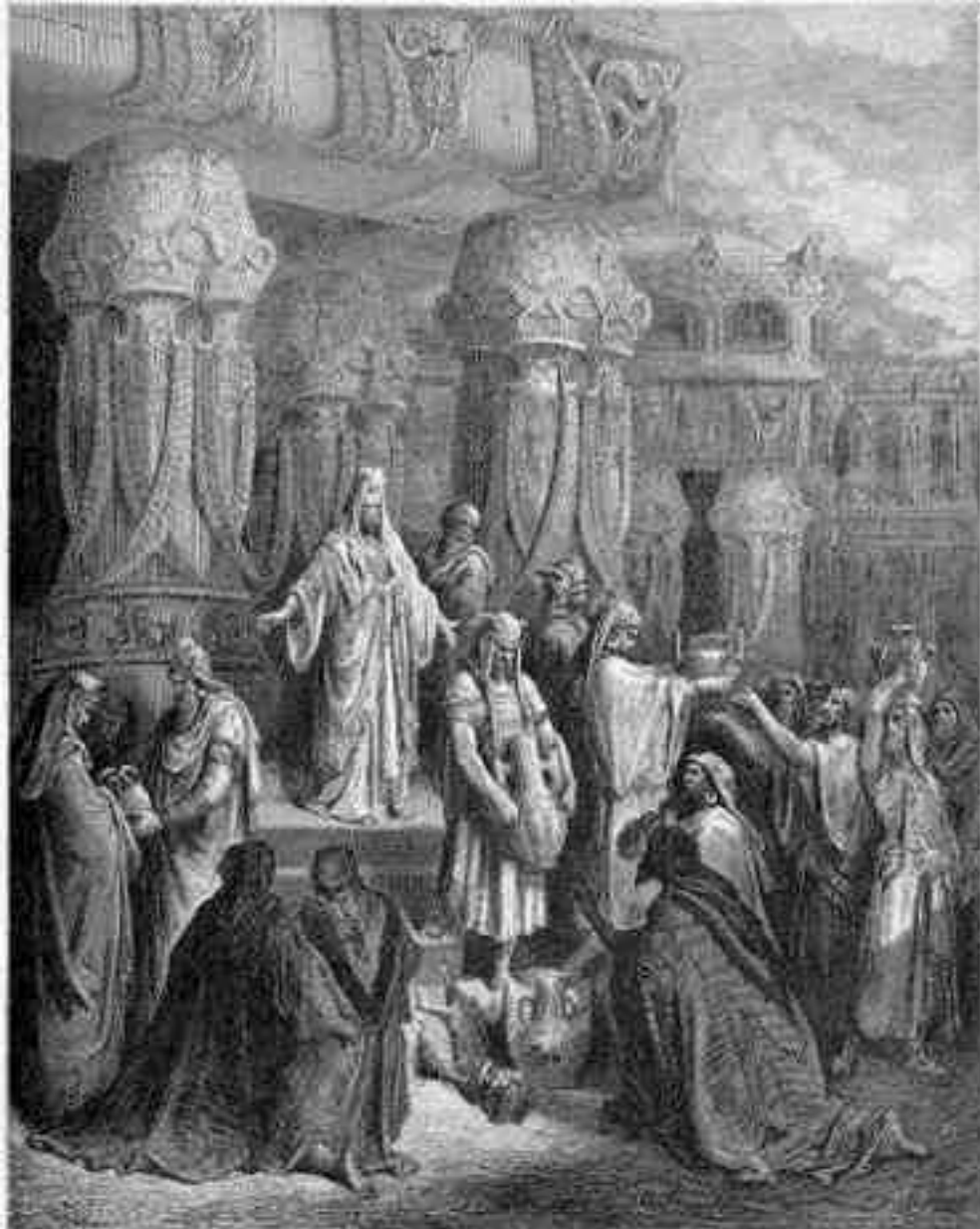
« TUON RIVOLGENDO I SEGRETI DEL TEMPIO

« Tuon the keys brought forth the secrets of the house of the Lord, which Sathan's « minister - And thou - in the house of his work. - (MAT. 16. 19)