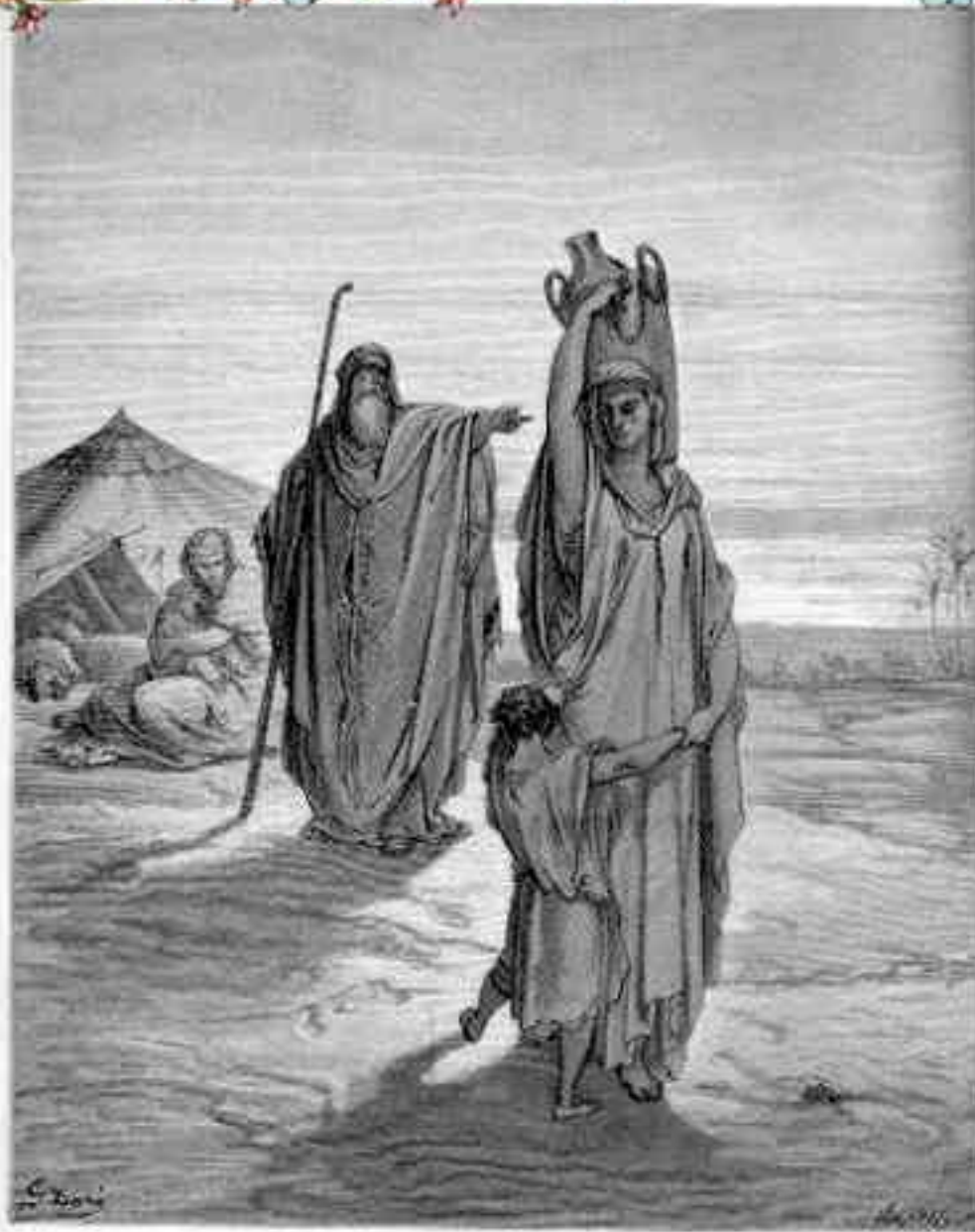
THE EXPULSION OF ISMAEL AND HIS MOTHER

And they said unto him, Where is Sarah thy wife? ... Sarah thy wife shall have a son ... Genesis 18:9,10 (18:1)