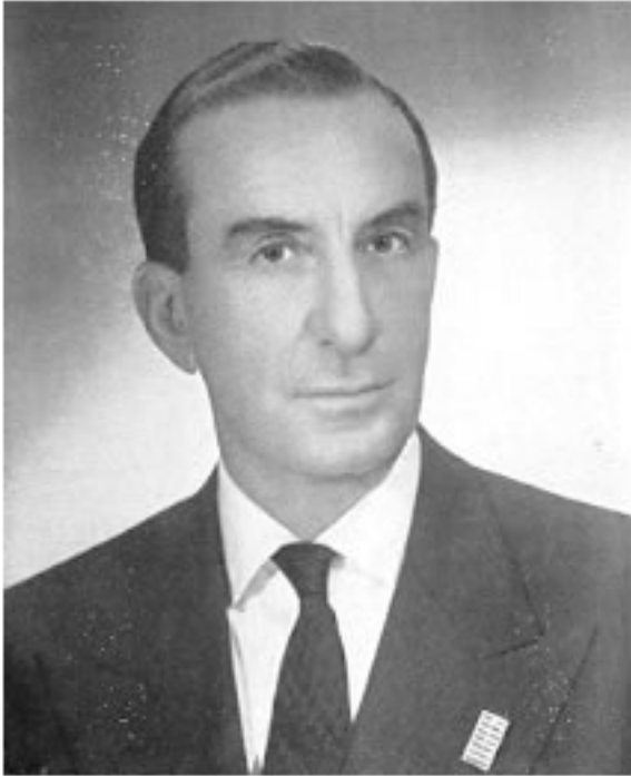
Emilio Pucci (1914-1992)