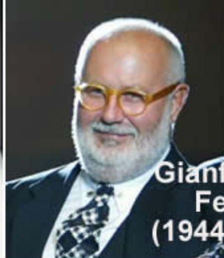
Gianfranco Ferré (1944-2007)