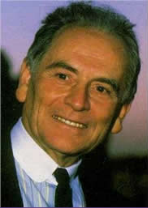
Pierre Cardin, nato Pietro Costante Cardin (1922)