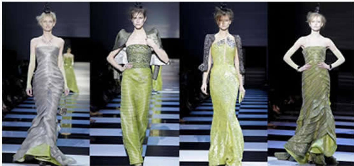
Giorgio Armani (1934)