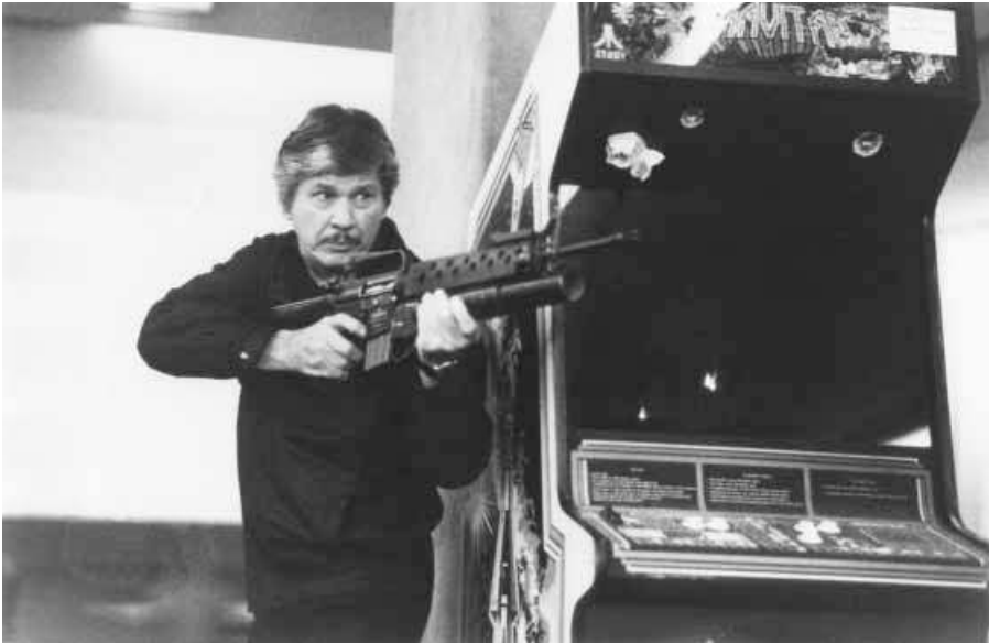
17. Death Wish 4: The Crackdown : The victim (Charles Bronson) turned avenger.

precarious height and become victims, like the outsized gangsters of Little Caesar (1930) and Scarface (1932), or they want heroic victims to move from suffering to action, like the wimps played by Dustin Hoffman in Straw Dogs (1971) and Marathon Man , and by Charles Bronson in all five Death Wish films (1974–94) [Fig. 17].