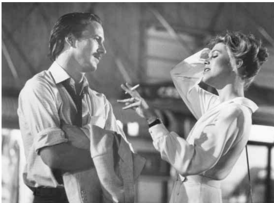
32. Body Heat : Coexperiencing the betrayal of Ned (William Hurt) by the femme fatale, Matty (Kathleen Turner).

such coercive frame. 4 The film relies instead on the less coercive implications of its imagery of uncontrolled, consuming fire and the intertextual allusions of its plot, dialogue, and mise-en-scène. Instead of knowing from the beginning that the hero is doomed, “the viewer,” as Silver and Ward point out, “coexperiences [the hero’s] betrayal” 5 [Fig. 32] by being encouraged to enjoy the sex scenes, which continue even past the murder of Edmund Walker (Crenna), as titillating spectacles that apparently bare all, even though they present the heroine far more deceptively than anything in Wilder’s clinically dispassionate film. 6