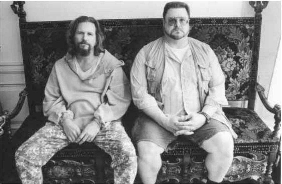
74. The Big Lebowski : A naïf sucked into a world of kidnapping, bowling, and impossible dreams come true. (Jeff Bridges, John Goodman)

ly shows that each exists in the other, like yin and yang, so that the criminal world is as comically normal as the normal world is comically outrageous.