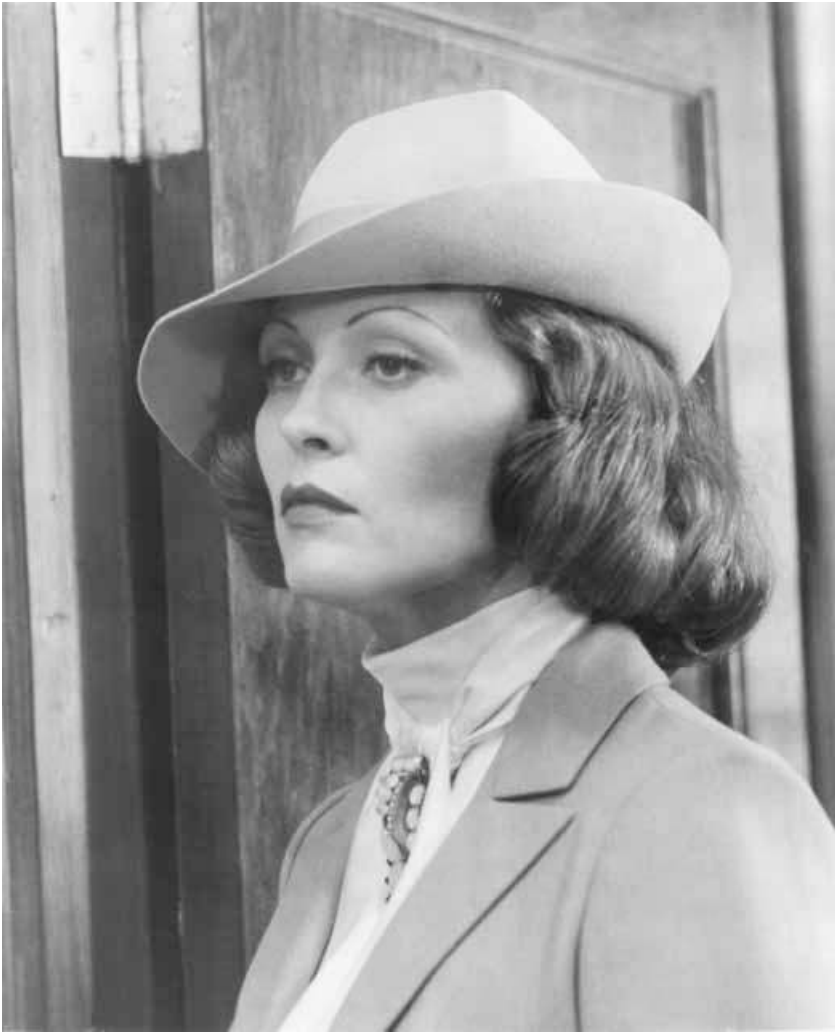
46. Chinatown : The glacial Evelyn Mulway (Faye Dunaway) as the hero first sees her.

No sooner, however, has the film replaced the normal visual duality between nature and culture with a thematic duality between its dream-like landscape and its down-to-earth hero than it begins to complicate it. Rumors about Mulway's scandalous affair, leaked to the newspapers, bring Gittes an icily menacing visit from the real Evelyn Mulway (Faye Dunaway) [Fig. 46], which forces him to acknowledge that he has not only, in classic private-eye form, been decoyed into taking the