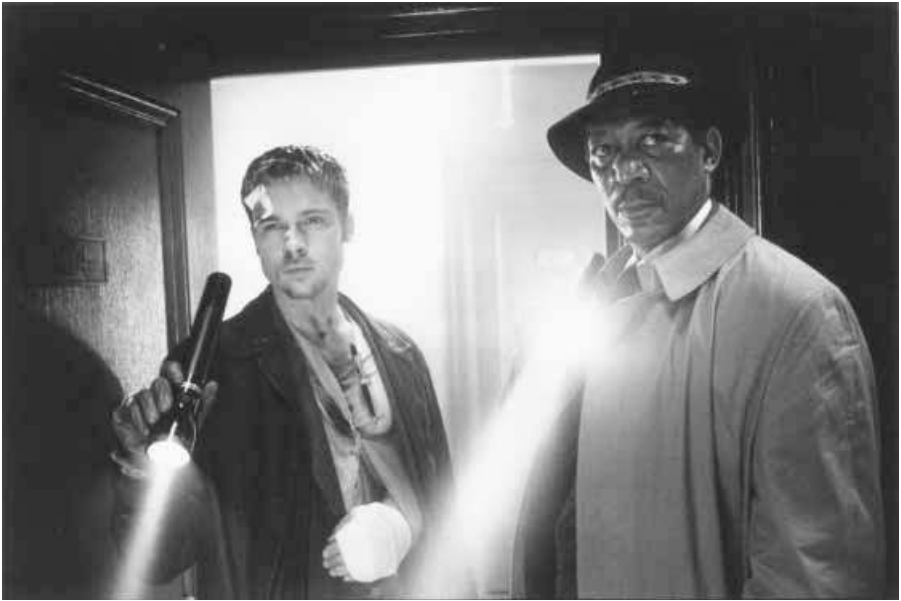
51. Se7en : Police officers (Brad Pitt, Morgan Freeman) led on by the criminal they are pursuing.

organized gang of criminals against an initially disorganized gang of police officers [Fig. 50]. Such films emphasize from the beginning strengths implicit in the police, and by extension the communities they represent and the authority that empowers them, by showing these strengths developing out of earlier weaknesses. Alternatively, instead of showing the police growing stronger, films may show the criminals growing weaker, as in police officers' use of variously complicit informers or the criminals' confessions. Such films, which predicate the power of the police on the weakness of criminal transgressors, more disturbingly compromise the duality between the police and the criminals by emphasizing the dependence of police work on the weakness or even the active collusion of criminals like John Doe in Se7en [Fig. 51].