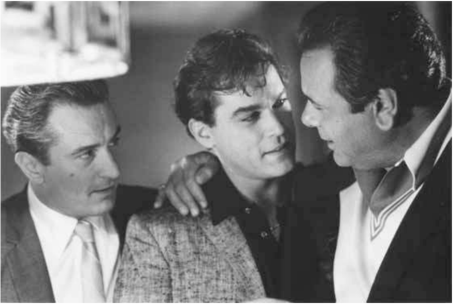
22. GoodFellas : "Keep your mouth shut, and don't rat on your friends." (Robert De Niro, Ray Liotta, Paul Sorvino)

called in to help you dispose of a dead body have to say "please" when he tells you what to do? Though it is ironic that films and gangs organized around breaking the rules should be so preoccupied by the rules they establish in their place, it is eminently logical for gangsters to spend their time debating rules of conduct and morality, because in opting out of the social norms that everyone else takes for granted, they alone are forthrightly considering the question of what rules ought to be followed and why.