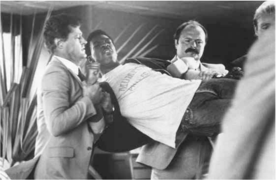
11. Beverly Hills Cop : Eddie Murphy (center) as anti-authoritarian authority figure.

personality a pig would have to have to be edible, offered an exuberantly comic counterpoint to Lynch's nightmare vision of middle America. Tarantino's trademark moments – the plunging of a hypodermic into the breast of the untouchable, accidentally overdosed gangster's wife Mia Wallace (Uma Thurman), the double-crossing boxer Butch Coolidge (Bruce Willis) and his mortal enemy Marsellus Wallace (Ving Rhames) taken prisoner by a pair of homosexual rapists much more dangerous than they are, the accidental point-blank shooting of the gang member being asked by Vincent Vega (John Travolta) whether he believes in miracles – treat criminal violence as a cosmic joke whose point, like the threat of nuclear holocaust in Dr. Strangelove (1964), is precisely that jokes are an inadequate response to death, chaos, and annihilation. The nature of Lynch's and Tarantino's jokey send-ups of contemporary social anxieties by translating them into impossibly elaborate criminal plots inaugurated a hip new subgenre of ironic crime comedies like 2 Days in the Valley (1996) [Fig. 12], Happiness (1998), Lock, Stock, and Two Smoking Barrels (1999), Go (1999), and Nurse Betty (2000).