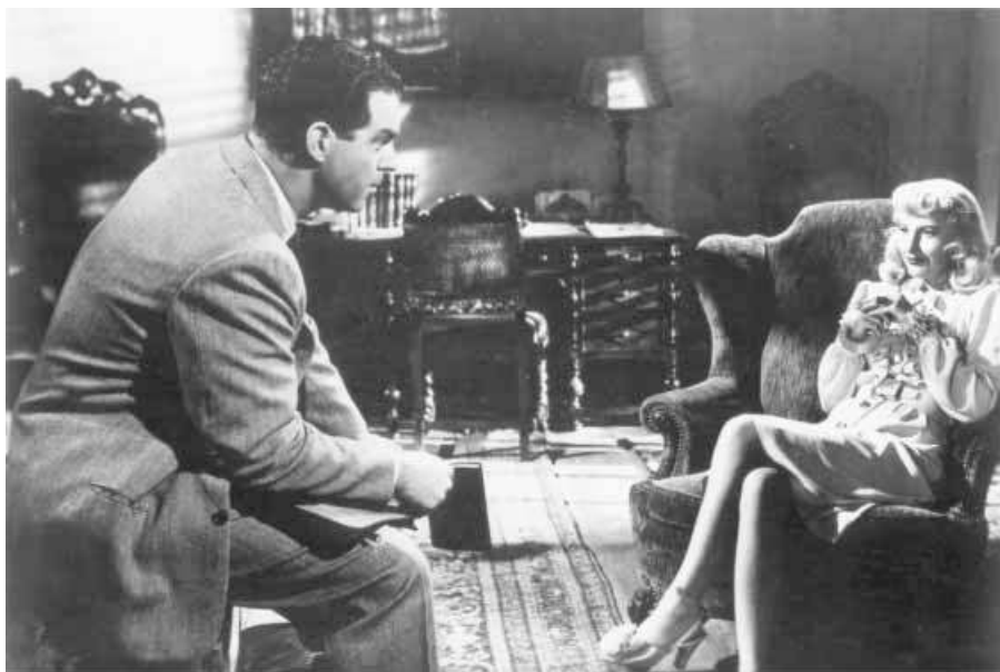
30. Double Indemnity : Walter (Fred MacMurray) admires the fetishistic anklet worn by Phyllis (Barbara Stanwyck).

Crazy and in The Big Heat (1953), in which the revolver framed in isolation just after the credits fires the shot that sets the whole story in motion – that the fetish can be inverted or satirized in The Maltese Falcon and The Big Sleep (1946), whose private-eye heroes regularly ignore or disarm villains who depend on their artillery, and Kiss Me Deadly , whose sociopathic private eye is forced to find new ways to hurt the suspects he interrogates after the police confiscate his gun.