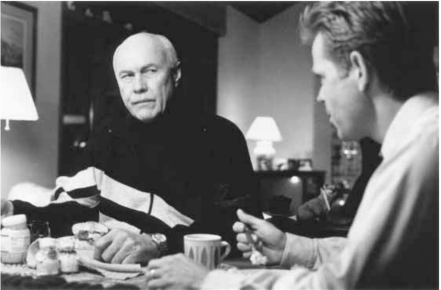
72. Fargo : The incorrigible shark (Harve Presnell) and the hopeless loser (William H. Macy).

one of them is a graduate of White Bear Lake High School (“Go Bears,” she helpfully volunteers), Marge asks what the two suspects looked like, provoking the following exchange: