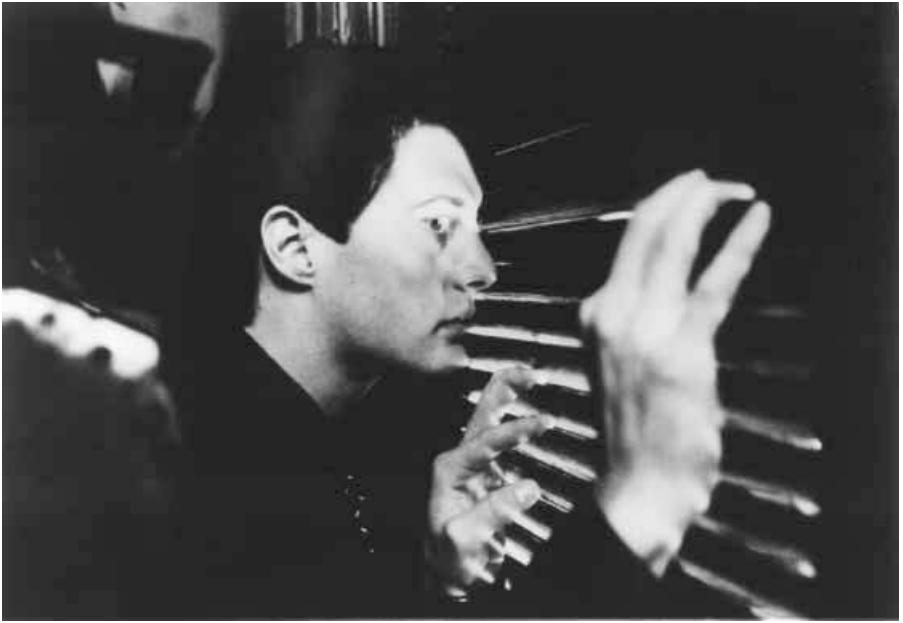
41. Blue Velvet : Jeffrey (Kyle MacLachlan) about to come out of the closet at knifepoint.

she and Jeffrey are walking the streets of Lumberton together), or weirdly uplifting liturgical music. When Sandy tells Jeffrey of a dream in which a dark, loveless world was brightened by the arrival of thousands of robins bearing “this blinding light of love,” her recitation is accompanied by organ music from the church whose stained-glass windows are framed in romantic soft focus behind her. Dorothy, by contrast, is associated exclusively with forbidden sexuality. She dresses entirely in black, red, or dark blue; her face, with its heavy coating of rouge and lipstick, is as fetishized as her wardrobe, especially in the extreme close-ups that repeatedly show her parted lips; her deep, mournful voice bespeaks sex as a painful ritual to be suffered, not consecrated in a church. No one would ever describe Dorothy, as Jeffrey describes Sandy, as “a neat girl” with whom it would be a pleasure to fall in love; she is rather the sex partner Jeffrey can neither acknowledge nor resist.