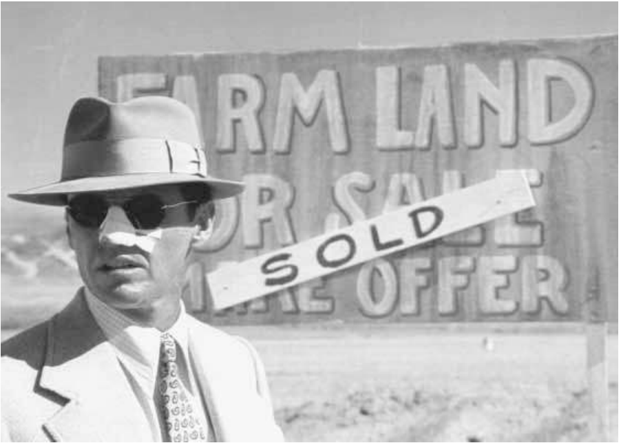
47. Chinatown : The disfigured nose of Gittes (Jack Nicholson) marks his vulnerability and rationalizes his suspicions of treacherous women.

personal revenge; but it also confirms his status as a former or potential victim whose heroic status is hard-won and liable to be revoked, particularly when he falls into the clutches of a treacherous woman [Fig. 47].