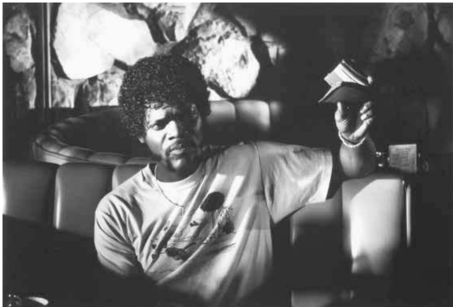
3. Pulp Fiction : A noir world of criminals like Jules Winnfield (Samuel L. Jackson) without the noir visual style.

genre than theorists of subgenres like the gangster film and the film noir have acknowledged. In fact, it is a stronger genre than the criminal subgenres that have commanded more attention, not only because its scope is by definition broader than theirs, but because the problem it addresses as a genre, the problem that defines it as a genre, places the film noir and the gangster film in a more sharply illuminating context by showing that each of those is part of a coherent larger project.