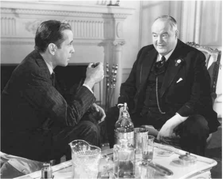
6. The Maltese Falcon : Humphrey Bogart as the private-eye hero tainted with guilty knowledge. (Bogart, Sydney Greenstreet)

in a pair of 1948 Huston films that confirmed the metaphoric power of the criminal, appearing as the psychotic Everyman Fred C. Dobbs in The Treasure of the Sierra Madre and as Lt. Frank McCloud in Key Largo , whose admonition to Americans to rouse themselves from their exhausted postwar apathy to battle the forces of evil represented by Johnny Rocco (Edward G. Robinson) makes it the most allegorical of all the great gangster films.