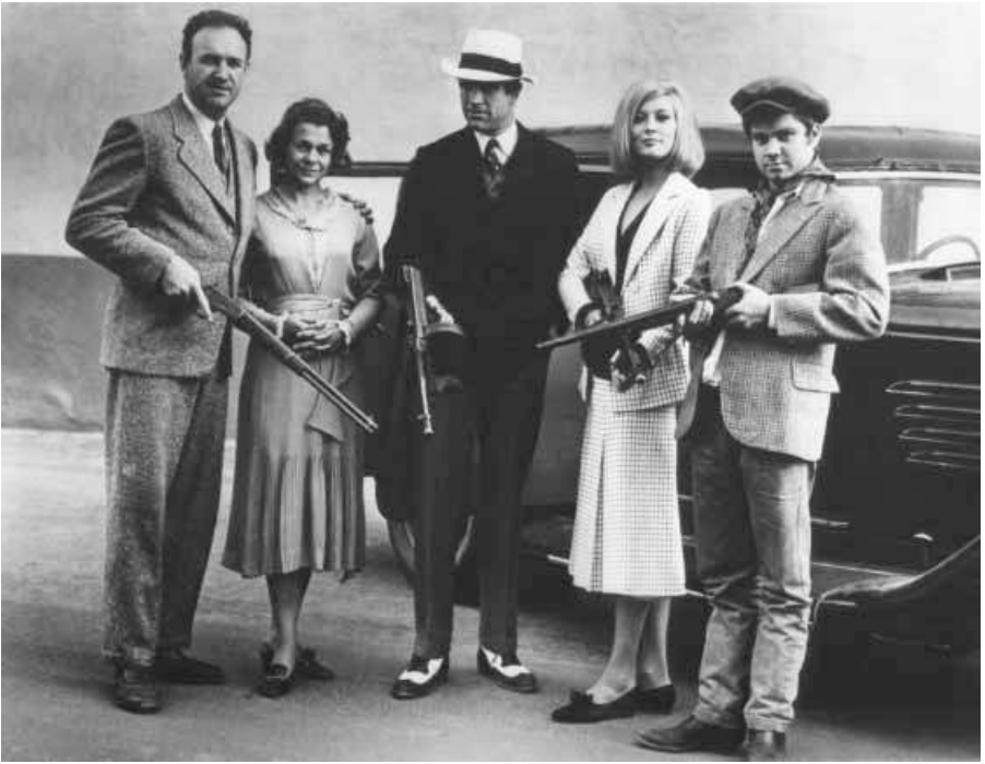
7. Bonnie and Clyde : Using thirties iconography to attack sixties authority. (Gene Hackman, Estelle Parsons, Warren Beatty, Faye Dunaway, Michael J. Pollard)

of 1967 unexpectedly reaped huge benefits from their antiestablishment tone: The Graduate and Bonnie and Clyde . Arthur Penn's flamboyant, affecting, and ultimately tragic saga of a pair of Depression-era gangsters, originally dismissed by reviewers as inconsistent and pointless, not only set new, post- Psycho standards for onscreen violence but helped identify a niche market of American teenagers who had previously had to make do with the likes of Pat Boone and Elvis Presley. Weighing Bonnie and Clyde's amoral killing against their youthful ignorance, the film managed to demonize the same American institutions as the gangster cycle of the thirties – the police, the banks, the law – but this time in metaphoric terms, using a pair of criminals from the thirties to attack the moral injustice of the draft and the violent injustice of the American experience in Vietnam [Fig. 7]. 24