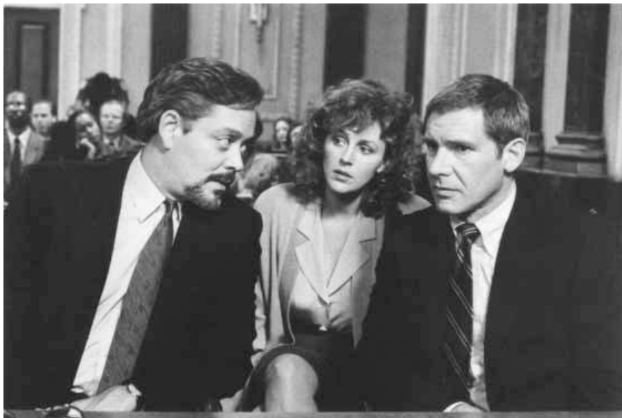
63. Presumed Innocent : Harrison Ford as a lawyer hero no more or less innocent than anyone else. (Raul Julia, Bonnie Bedelia, Ford)

and then tracking down a hospital corridor toward the open door of the room where Sunny von Bülow lies in an irreversible coma, attended by round-the-clock nurses who monitor her condition, bathe her, and turn her body to prevent bedsores, leaving her, as she puts it in disembodied voice-over, “brain dead, body better than ever.”