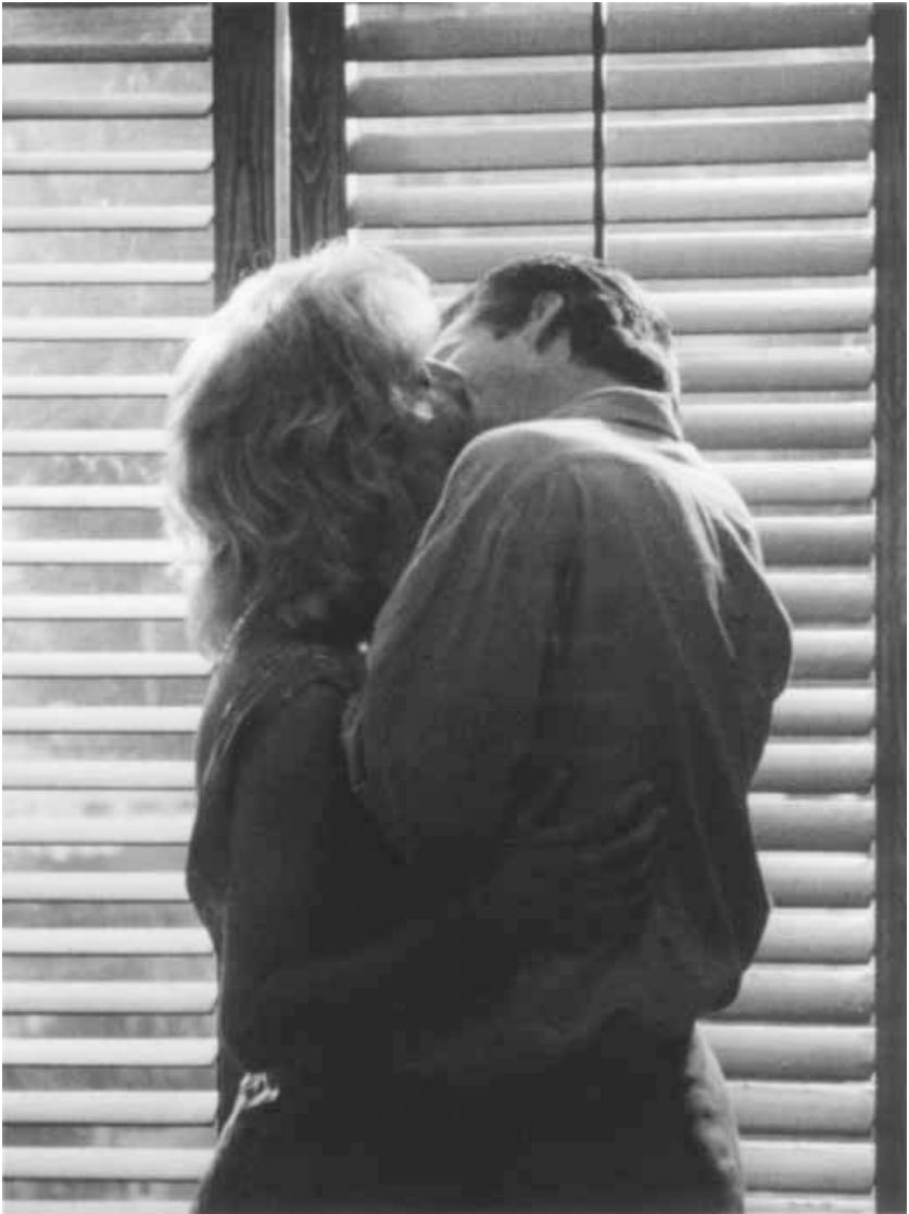
16. D.O.A. (1987): The doomed hero gets a new lease on life. (Meg Ryan, Dennis Quaid)

small-town accountant who is slipped a poisoned drink at a crowded, noisy San Francisco bar. By the time he learns he has been poisoned, nothing can be done to stop the poison's action – he will be dead in a day or two – but Frank, after the initial denial, shock, and depression