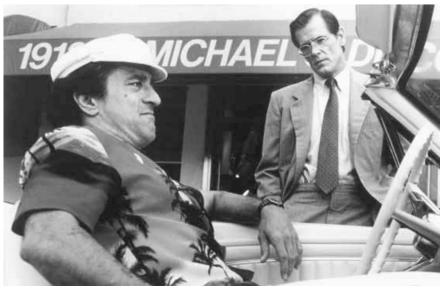
77. Cape Fear (1991): Robert De Niro's downscale sociopathology. (De Niro, Nick Nolte)

1994) or businesspeople whose turn toward literal criminality indicts their professional milieu metaphorically ( The Lavender Hill Mob , 1951; The Bad Sleep Well , 1960; A Shock to the System , 1990; Glengarry Glen Ross , 1992; American Psycho , 2000). Films about outlaws – sympathetic lawbreakers like Robin Hood, Jesse James, and the protagonists of Thelma & Louise (1991) – provoke debates about the morality of the established order. Films about prisons like those in The Big House (1930), 20,000 Years in Sing Sing (1932), and Brute Force (1947) present them as social microcosms from which escape, the convicts' one obsession, is no more possible than from life itself; even when Tom Connors (Spencer Tracy) does escape from Sing Sing, he is obviously fated to return. The doomed capers in The Asphalt Jungle and The Killing (1956), whose gangs are assembled, like pickup ball teams, for the purpose of pulling off one big job, exchange the romantic fatalism of the gangster film's promethean, system-defying individual hero for a cynical fatalism about social organizations themselves.