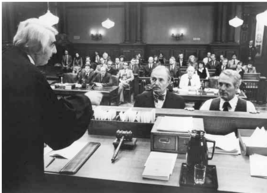
60. The Verdict : Shirt-sleeved Frank Galvin (Paul Newman) takes on the Boston Goliath Edward J. Concannon (James Mason) before Judge Hoyle (Milo O'Shea).

his life by deserting the 9th Cavalry, which he calls “my home, my real freedom, and my self-respect.” Hence the design of the film, alternating low-ceilinged interiors with low-horized exteriors, closely echoes that of its black-and-white predecessor Stagecoach (1939), also directed by John Ford and photographed by Bert Glennon. The contrast confirms the judgment of Rutledge’s lawyer, Lt. Thomas Cantrell (Jeffrey Hunter): “It is this court that stands on trial, and not Sergeant Rutledge.”