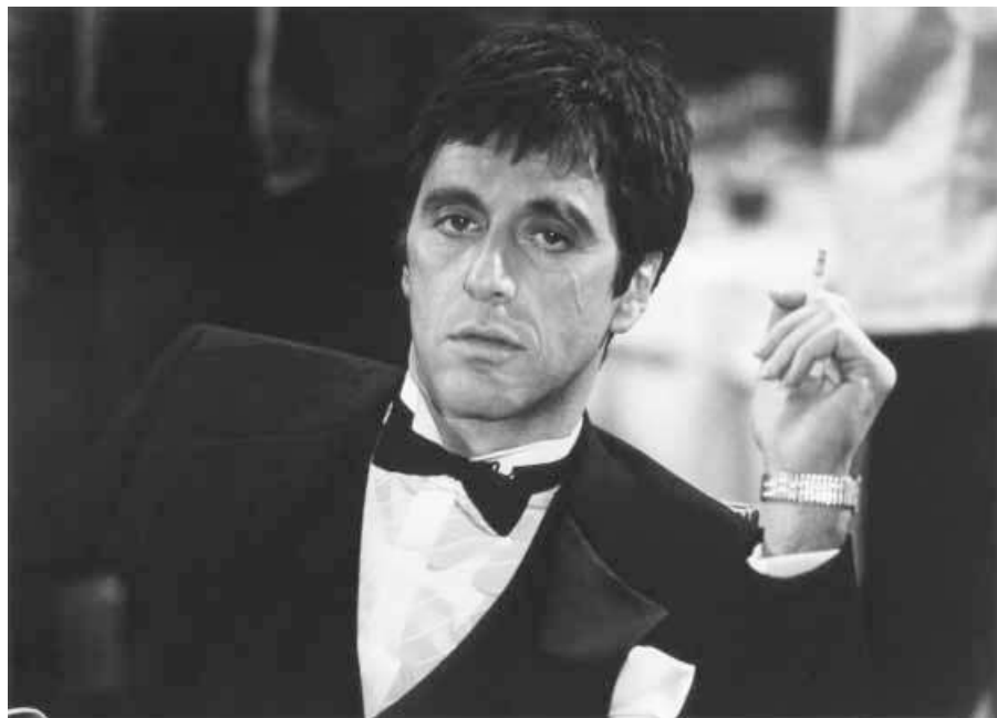
9. Scarface (1983): Marielito Tony Montana (Al Pacino) wasted by the drugs that mark his success.

creasingly condemned as a trigger for the violence of youthful “super-predators” and high-school terrorists. On the other hand, violence was more and more successful, and more and more in demand, in selling movies to a generation of teenagers who had grown up with remote controls that had sharpened their impatience, discouraged the deferred gratifications of slow-moving films, and reintroduced Mack Sennett’s eighty-year-old principle of slapstick comedy: The introduction, buildup, and payoff of each joke had to take less than a minute.