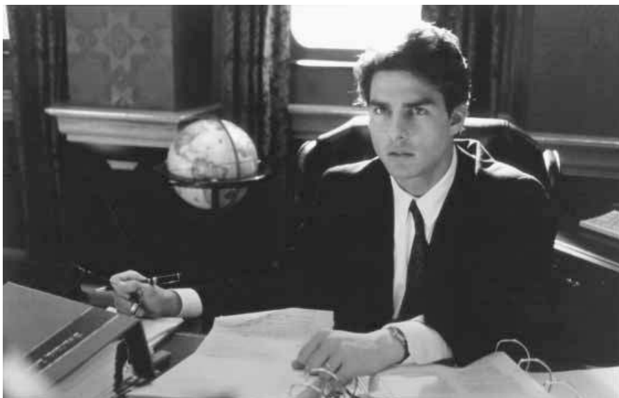
62. The Firm : Cruise again, as a lawyer hero who has not even passed the bar exam.

are apparently more representative of the justice system. Julia Roberts's eponymous heroine in Erin Brockovich represents the antilawyer (trash talk, sexy clothes, unlimited empathy) who is also a nonlawyer. (Her herculean efforts on behalf of her boss's pro bono clients are bracketed by two memorable remarks: "I hate lawyers. I just work for 'em," and "Tell her I'm not a lawyer. That may help.")