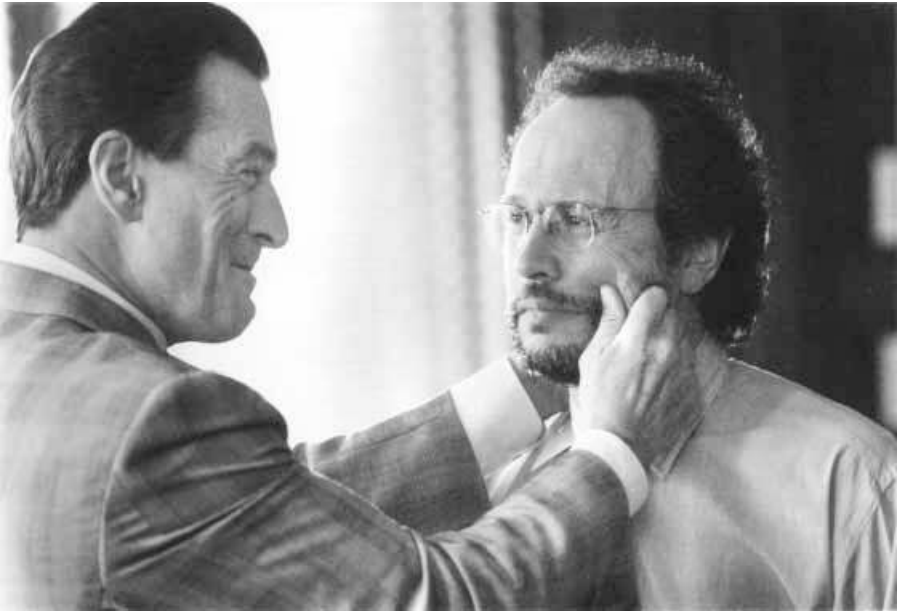
68. Analyze This : The iconic mob boss (Robert De Niro) and his unwilling psychiatrist (Billy Crystal).

unsuccessful traps for Road Runner, are so repetitious, both individually and as a series, and feature such a small cast of characters and so few possibilities for motivation and incident that their violent plots become reassuringly ritualized. Audiences who know that the coyote will never catch his innocent prey can relax and enjoy the complexity of his traps and the certainty that he will be caught in them himself, usually in ways unique to the drawn universe of cartoons. When the coyote steps over the edge of a cliff in his enthusiastic pursuit of Road Runner, for instance, he will never fall until he notices that he is in danger; he will have plenty of time for a farewell to the audience; and he will never suffer lasting damage from his well-deserved misadventures. The violence of the series, as the cliché “cartoon violence” suggests, is inconsequential. The ritual repetitions of highly predictable plots, spiced by the playful physical inventions, transformations, and impossibilities proper to the logic of the cartoon universe, at the hands of a villainous agent who will never grow out of his obsession or develop anything but a droll ad hoc self-consciousness, all work in the service of a comically selective imitation of the real life of criminals, natural predators, and physical reality.