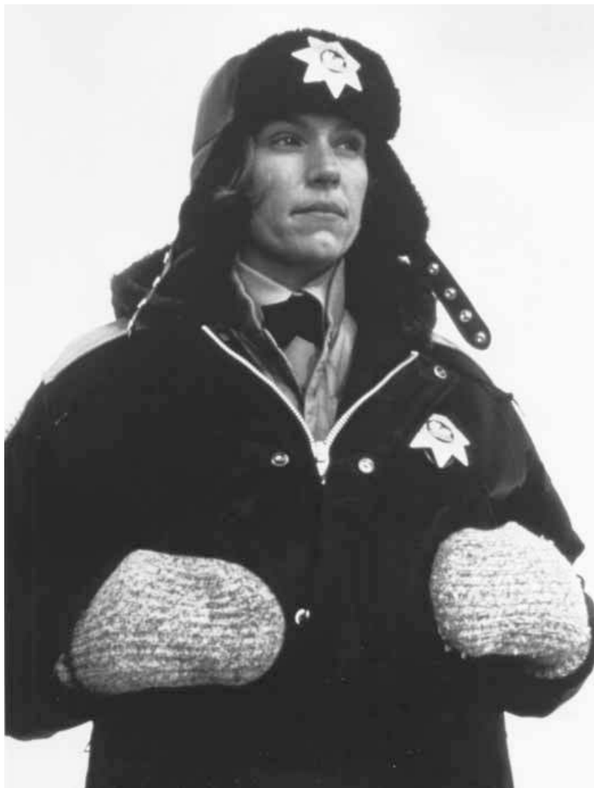
73. Fargo : Marge Gunderson (Frances McDormand) – good-humored earth-mother or unimaginative dolt?

sents poses as direct an affront to the criminal outrages perpetrated by the kidnapers as their outrages do to the ideas of normalcy represented by Jerry's smile, Paul Bunyan's statue, and the film's endless wastes of snow. Nor does the film show either side able to comprehend the other, either in individual collisions or at the fadeout; it mere-