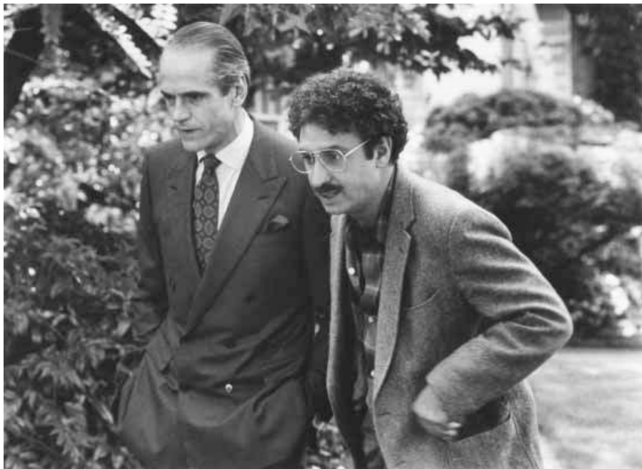
66. Reversal of Fortune : Dershowitz's patrician client looks more like a lawyer than he does. (Jeremy Irons, Ron Silver)

wife is replaced by his devoted son Elon (Stephen Mailer), his ex-lover Sarah (Annabella Sciorra), and his rowdy team of students-turned-colleagues, herded, in one of the few details borrowed from Dershowitz's book, into different rooms of his house according to their specific assignments. 2 When Dershowitz is on the telephone making still another argument on behalf of the Johnson brothers, Sarah's comment to Elon – "It's great when he's like this, huh? I only wish he had something left for the people around him" – simply confirms Dershowitz's own comfortable self-assessment: "My clients are the people I care about."