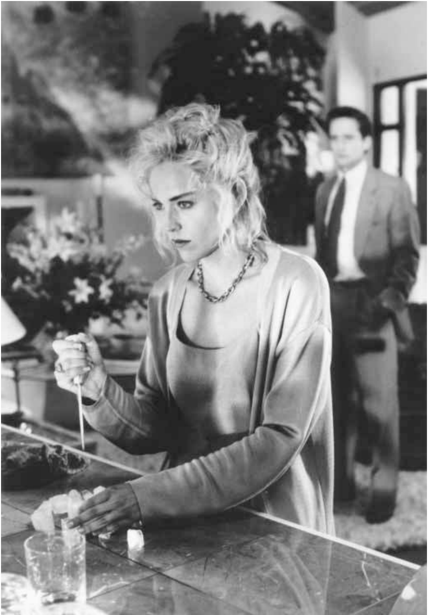
36. Basic Instinct : An unequal twinship in which the woman (Sharon Stone) wields the icepick.