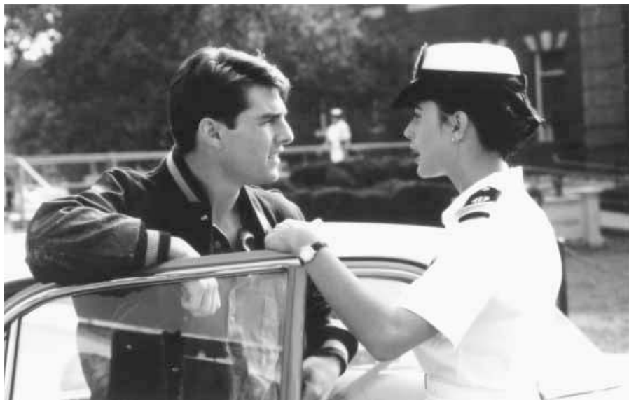
61. A Few Good Men : Lt. Kaffee (Tom Cruise) fights with everyone, even allies like Lt. Cmdr. Galloway (Demi Moore).

official (the clandestine order immediately afterward to institute a “Code Red” against the informer); orders from one’s legal superiors against individual conscience, and hence individual against group welfare; and finally the authority of the Marine command against that of the court. So powerful are these conflicts that Lt. Col. Matthew Markinson (J. T. Walsh) is destroyed by them, and even Kaffee’s two clients obtain only a split verdict on their actions.