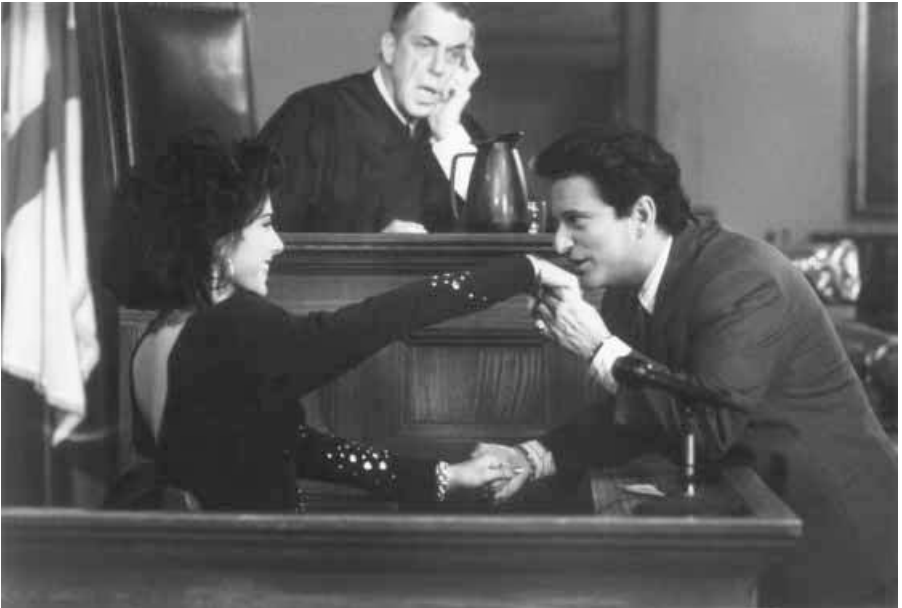
8. My Cousin Vinny : The antilawyer turned lawyer hero. (Marisa Tomei, Fred Gwynne, Joe Pesci)

highly addictive crack that was subject to the most severe criminal penalties.