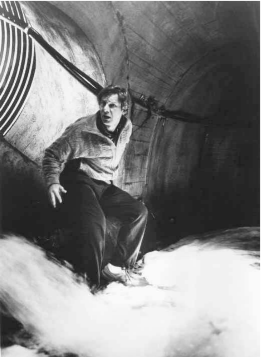
18. The Fugitive : Instead of simply escaping from the police, Dr. Richard Kimble (Harrison Ford) must track down the real criminal.

unconvincing self-justifications of D-FENS in Falling Down indicates that American movies do not necessarily approve this kind of empowerment; but they are clearly fascinated with it, whatever its costs, even at its most sociopathic [Fig. 19].