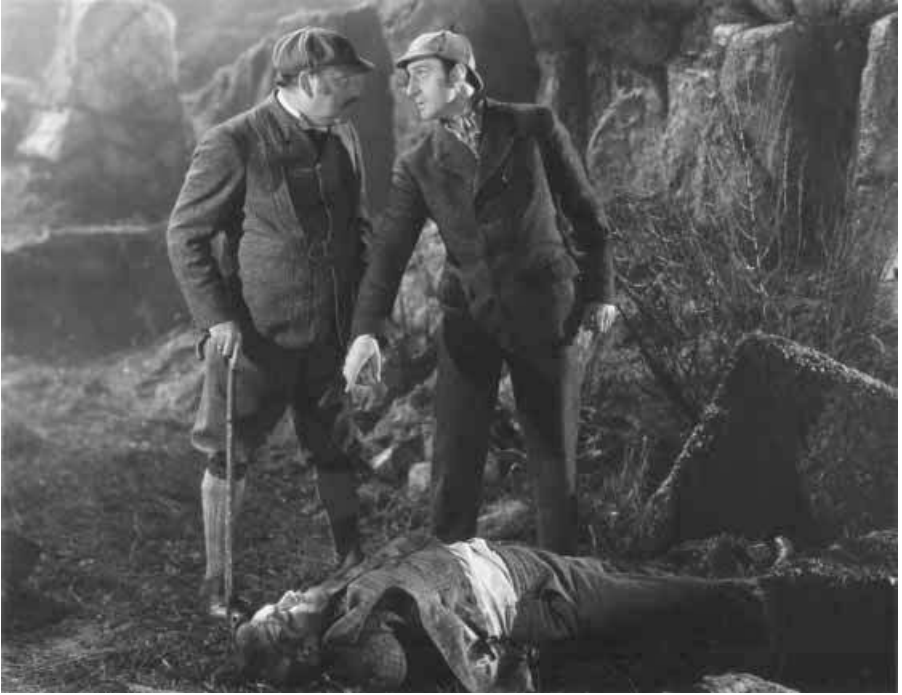
5. The Hound of the Baskervilles : Nigel Bruce and Basil Rathbone as the best-loved Watson and Holmes of all.