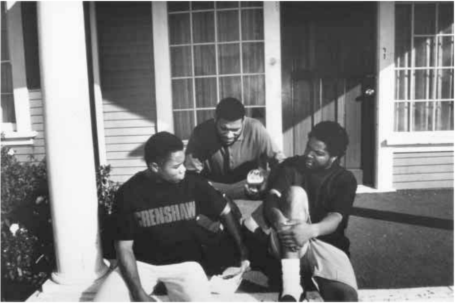
23. Boyz N the Hood : Gang loyalties based on childhood friendships. (Cuba Gooding Jr., Larry Fishburne, Ice Cube)

recruited specifically for the skills they bring to a proposed heist. Both Howard Hawks's Scarface and Brian De Palma's 1983 remake emphasize the gradual withdrawal of the gangleader from the day-to-day operations of the gang. By the time of New Jack City (1991), kingpin Wesley Snipes's involvement in his thriving cocaine empire seems to be limited entirely to executing traitors and consuming his own product.