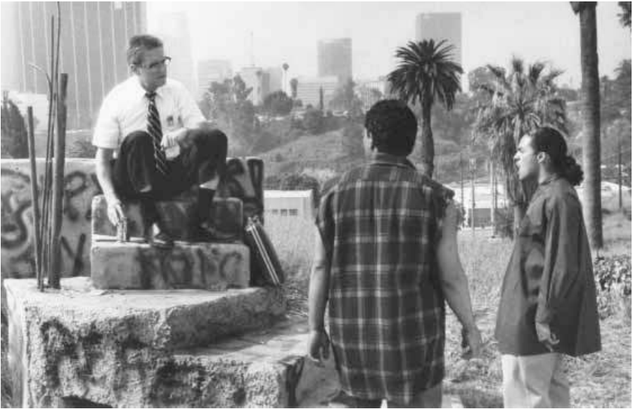
19. Falling Down : The fascination of the sociopathic vigilante. (Michael Douglas, left)

show how deeply they have been brutalized by making them cross the line that separates law-abiding avengers from criminals. It would be surprising if Hollywood did not try all three tactics, often in the same movie.