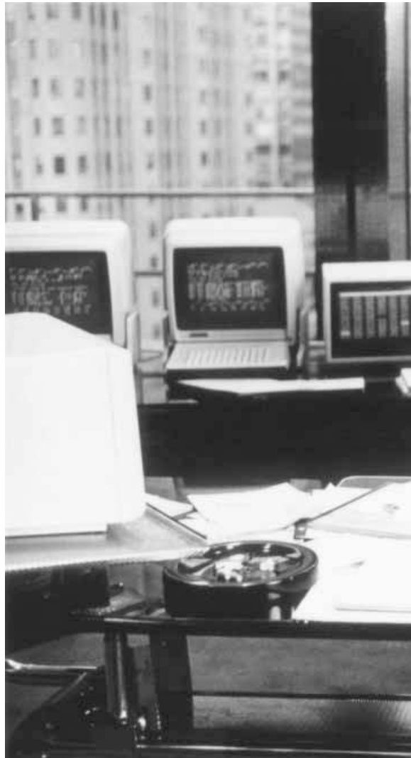
76. Wall Street : Michael Douglas as the king of white-collar crime.

man-on-the-run story, has been analyzed at length not only by Charles Derry and Martin Rubin 7 but by forty years' work of commentary on Alfred Hitchcock. To emphasize the importance of such films from The 39 Steps (1935) to The Fugitive (1993) to the crime genre would foreground questions not only about the fugitive's and the pursuing system's moral complicity but about the range of tactics fugitives employ to keep one step ahead of the law. To emphasize films about white-