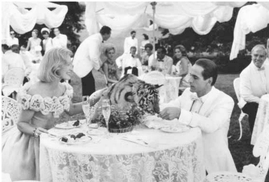
64. Reversal of Fortune : A flashback shows the brittle charm of the von Bülow's courtship. (Glenn Close, Jeremy Irons)

64]. When Dershowitz taxes him with his indifference to Sunny's fate, he replies, "Of course I care, Alan, I just don't wear my heart on my sleeve." At von Bülow's Manhattan apartment, painterly, symmetrical shots of von Bülow and his mistress, Andrea Reynolds (Christine Baranski), are intercut with even more severely symmetrical shots of Dershowitz perched uncomfortably alone in a chair in the center of the frame.