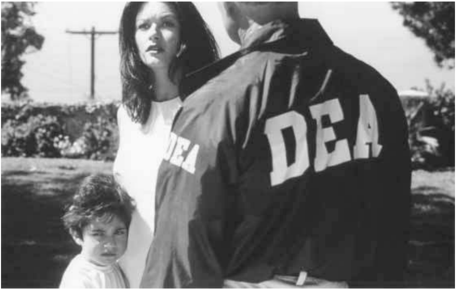
79. Traffic : Catherine Zeta-Jones as one more victim who turns criminal to survive.

with himself over whether he should emulate the mob that tried to kill him in Fury . Double Indemnity 's Walter Neff and Basic Instinct 's Det. Nick Curran are drawn into criminal behavior through their involvement in forbidden romance. J. J. Gittes confronts his own pettiness and greed in Chinatown , and Jeffrey Beaumont his outlaw sexuality in Blue Velvet , through their battles with monstrous antagonists; Det. Lt. Frank Bullitt and Alan Dershowitz confront endless criticisms of their work; Marge Gunderson restores law and order to Fargo by her failure to understand the dark humor her story embodies; even Hercule Poirot, in Murder on the Orient Express , ends by covering up a crime committed by a group of vigilantes whose cause he feels is just. Each of these films, like the subgenres they represent, appeals to the audience's own antisocial tendencies by cloaking them in the glamour and mystery of the criminal, reassuring the audience that this fantasy is only a waking dream, and leaving behind a lingering suggestion that the duality of right and wrong that supported it may be due for a closer look next week.