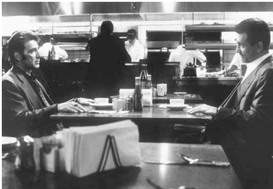
53. Heat : A historic pairing of Al Pacino and Robert De Niro as a cop and his equally obsessive criminal double.

the rights of suspects, rather than the conflicting rights of the larger society, that they help obviously guilty suspects go free.