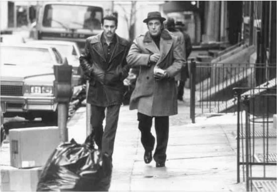
56. Donnie Brasco : The undercover cop (Johnny Depp) and his unwitting mob mentor (Al Pacino).

tional conflicts concerning authority and the law. The crucial period in the Hollywood police film is the late 1960s and early 1970s, not only because it is a period of unprecedented economic freedom and formal experimentation in American films generally, 4 but because a spate of rioting in Watts (1965), Detroit (1967), Newark (1967), and on innumerable college campuses – culminating in the National Guard’s killing of four students at Ohio’s Kent State University (1970) – fed public debate about both police tactics and the legitimacy of the government they represented.