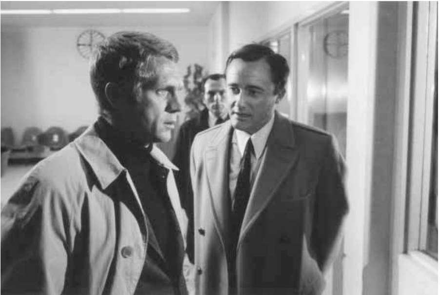
58. Bullitt : The self-contained hero (Steve McQueen) confronts his real enemy, the hypocritical prosecutor (Robert Vaughn), at the airport.

unapologetic Chalmers, who attempts to press his claim on the tarnished Ross's testimony by telling Bullitt that even though his star witness has now been proved a killer who faked his own death, he is still determined to get him to testify [Fig. 58]. "The Organization – several murders – could all do us both a great deal of good," he adds. "We both know how careers are made. Integrity is something you sell the public. . . . We must all compromise," with a scorchingly quiet reply: "Bullshit. Get the hell out of here now." By this time, Bullitt's emphatic rhetoric (the word "bullshit" was rarely heard in 1968 movies) on behalf of the pancultural cachet of law enforcement over the rule of law the film reserves to the gratingly upper-class Chalmers and his minions is backed by the dangerous physical actions that gives his words their authority.