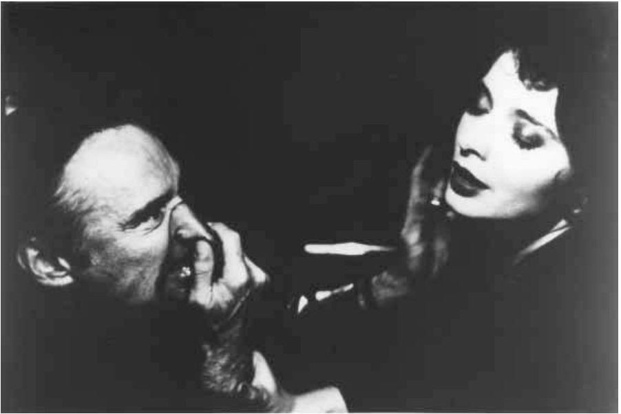
42. Blue Velvet : The nightmare logic behind the rape of Dorothy (Isabella Rossellini) by Frank (Dennis Hopper).

Even Murder on the Orient Express ends by revealing the links between detectives and criminals. Ratchett, the threatened victim who first solicits Poirot's help, is really a criminal himself. The innocent suspects from whom Poirot must pick the criminal are all guilty. Their shared guilt impeaches that order as criminal throughout. The detective deputized to identify the criminal for the absent authorities instead agrees to let them go, since the friend who authorized his investigation agrees with him that the victim, not the killers, is the true criminal. Even the film's concluding tableau, a ritual series of toasts among the passengers who have succeeded in killing Ratchett, celebrates homicide rather than detection as the therapeutic restorer of the social order thrown into chaos by the kidnapping of Daisy Armstrong. Whether as spectacularly as Blue Velvet or as unobtrusively as Murder on the Orient Express , the unofficial detective film, however resolutely it separates the detective from the criminal, cannot help showing how each lives in the other.