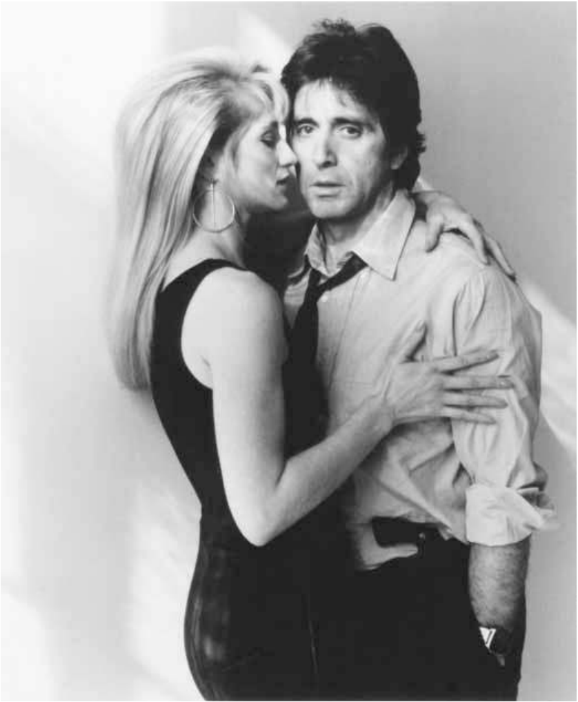
35. Sea of Love : Another compromised cop, another reckless affair. (Ellen Barkin, Al Pacino)

cently, on the job. After initially considering Catherine an adversary who provides a rationale for his professional identity, Nick is eventually forced to see her as the untrammelled self he longs to be.