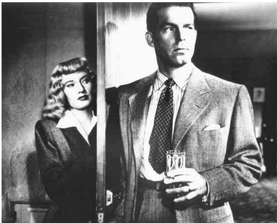
31. Double Indemnity : The hero (Fred MacMurray) trapped by his knowledge of his guilty double (Barbara Stanwyck).

failed protégé Walter's rogue salesman, who always dresses in non-committal gray suits, except when he is impersonating the man he is planning to kill. But these external doubles are only a sign of a deeper psychological doubling that is revealed by Walter's incautious gaze over Phyllis's shoulder while she tellingly remarks, "I hope I've got my face on straight" (indicating that her face is simply a mask assumed for the occasion), and he replies, "It's perfect for my money" (indicating that he is only too eager to accept the mask at face value without looking deeper). This sort of doubling is represented in different terms when Phyllis, coming to visit Walter's apartment after the murder, hears Keyes inside and hides behind the apartment door as Keyes comes out into the corridor, trapping Walter between the two people who are contending for his soul. As Walter poses before the blank door with Phyllis and Keyes on either side of him, the film asks which Walter will prevail: Phyllis's conspirator or Keyes's employee? It answers this question when he shields Phyllis from Keyes, waving her in back of the door with a telltale hand [Fig. 31].