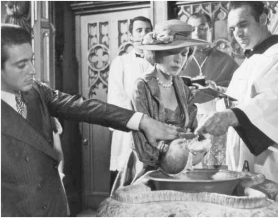
27. The Godfather : Michael rejects Satan on behalf of the godson whose father he is about to have killed. (Al Pacino, Diane Keaton)

threat against his life. With his father dead, Michael moves swiftly in ways his father never would have countenanced. Going a step beyond his preemptive murder of Sollozzo and McCluskey, he orchestrates the executions of the heads of all the rival families and of Moe Green (Alex Rocco), the Las Vegas hotelier who refused to sell him the casino he had sought as the base of operations for the Corleones' newly legitimate family business. He also avenges his brother Sonny by arranging the murder of Sonny's betrayer, Carlo, and wins the renewed loyalty of the family members who remain after his purge of the ranks.