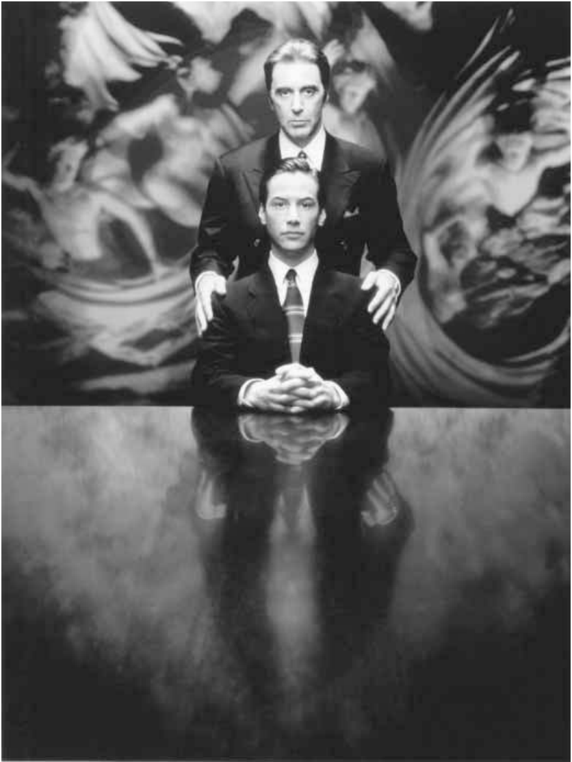
59. The Devil's Advocate : A lawyer hero (Keanu Reeves) literally in league with the Devil (Al Pacino).

(1992), A Time to Kill (1996), and Witness for the Prosecution (1957; based on a 1949 story and 1954 play by Agatha Christie), in which the magisterial Sir Wilfrid Robarts (Charles Laughton) takes a client he has proved to his own imperious satisfaction is innocent, only to be flimflammed by both the client and his resourceful wife.