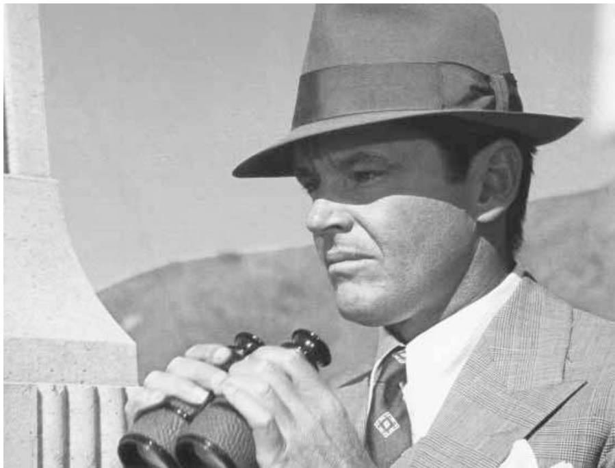
45. Chinatown : A hero (Jack Nicholson) who does nothing but watch.

ent. If Gittes is following a man rather than a woman, it is a man whose lack of masculinity, already foreshadowed by his effeminate bowties, his self-effacing manner, and his mildly ineffectual arguments against the new dam, will become steadily more apparent as the film proceeds, apparently confirming Gittes's own manliness through the private eye's formulaic algebra of contrast.