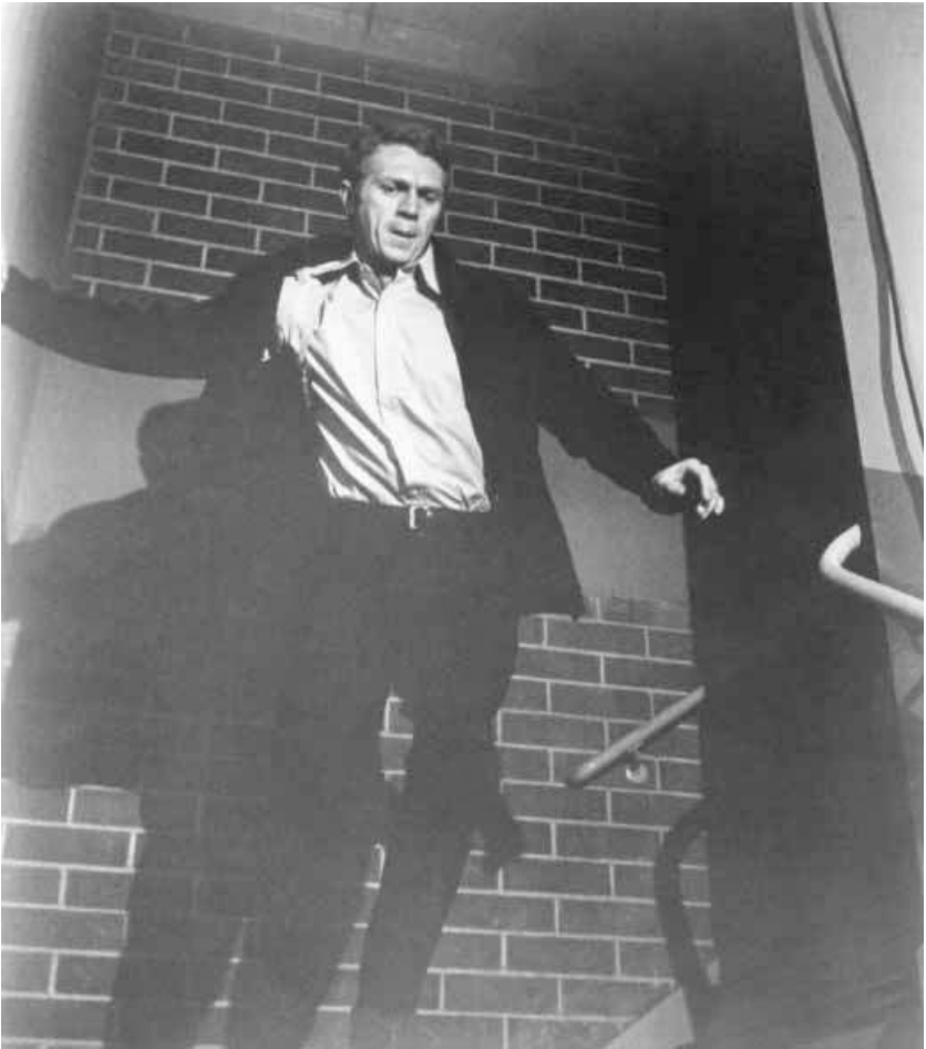
57. Bullitt : The athletic hero (Steve McQueen) chases his ostensible enemy through the hospital.

ing risks to capture them because they are all too used to cutting legal corners in the course of their job.