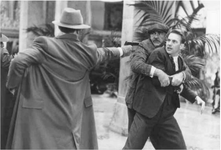
49. The Untouchables : Police power (Sean Connery, Kevin Costner) trumped by the greater power of Al Capone's bodyguards.

Nonetheless, viewers routinely assume the police will succeed. Sometimes their confidence is justified by their knowledge of history, as in The Untouchables , in which audiences' awareness of how Capone was actually brought down makes an ironic joke of the apparently pointless efforts of Oscar Wallace (Charles Martin Smith) to prove Capone guilty of tax evasion. Other times, audiences rely on internal foreshadowing and narrative logic, as in One False Move (1991), in which it is clear early on that the three criminals fleeing from Los Angeles to faraway Star City, Arkansas, are actually running into the arms of the law. Even when they have neither history nor any specific foreshadowing to guide them, however, audiences' experiences of films whose stars are cast as police officers will be framed by their experience of generic conventions in myriad earlier police films, which predict, with remarkably few exceptions, the success of the police, at whatever cost, in identifying and apprehending or destroying the criminals.