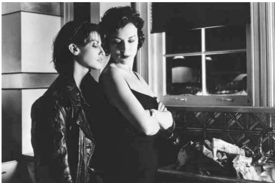
37. Bound : Conspirators (Gina Gershon, Jennifer Tilly) drawn together, for better or worse, by their similarities.

er, or which one will betray the other one first. In a heterosexual noir or erotic thriller the answer would be foreordained, since although men can rage murderous through erotic thrillers like Crimes of Passion (1984), Body Double (1984), Consenting Adults (1992), and Sliver , men rarely betray the women with whom they conspire to break the law. The role of double-crossing criminal conspirator is reserved for women in such films as Out of the Past (1947), Criss Cross (1949), Body of Evidence (1993), Romeo Is Bleeding (1993), and Palmetto (1998). 12 This time, however, there is no way of telling which of the two females will crack first.