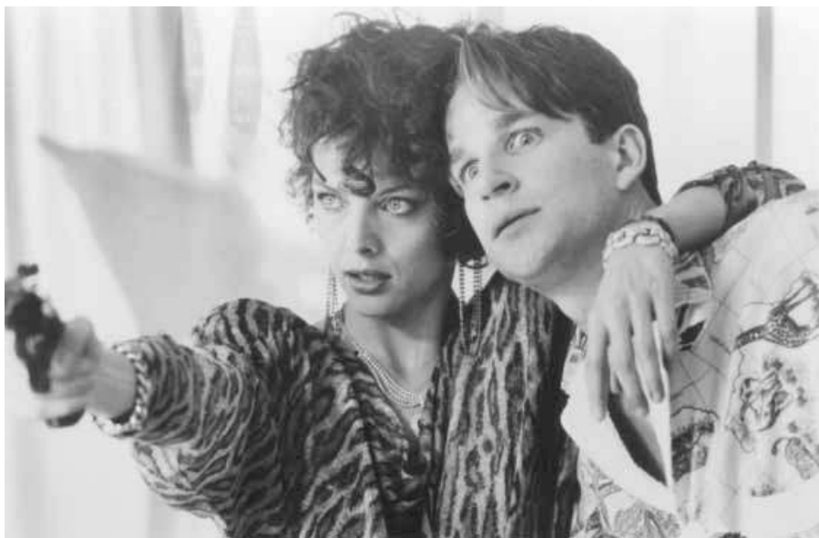
67. Married to the Mob : The embattled Mafia widow (Michelle Pfeiffer) and her ineffectual police suitor (Matthew Modine).

the incompetent detectives played by W. C. Fields in The Bank Dick (1940) and Groucho Marx in The Big Store (1941) and Love Happy (1950), Inspector Jacques Clouseau of the Pink Panther movies (1964–93), and Axel Foley in the Beverly Hills Cop franchise (1984–94). Finally, criminal threats can be defused and rendered comical if the criminals themselves are played for laughs, like the maiden-aunt killers of Arsenic and Old Lace (1944); the oblivious couple who commit the murders in Eating Raoul (1982) in hopes of financing a restaurant; the aspiring standup comic of The King of Comedy (1982) who kidnaps a talk-show host in order to break into show biz; and the mob boss in Analyze This (1999) who consults an unwilling psychiatrist when he unaccountably loses his appetite for killing [Fig. 68].