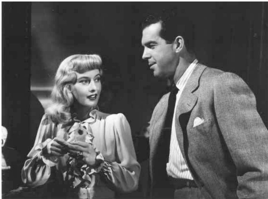
29. Double Indemnity : The femme fatale (Barbara Stanwyck) and her victim (Fred MacMurray).

from the film also underlines one of its most cynical jokes: the absence from the film of any police officers, emphasizing Cain's belief in both Double Indemnity and The Postman Always Rings Twice that the officers sworn to uphold the law have much less interest in its enforcement than the insurance companies who stand to lose financially from any fraud.