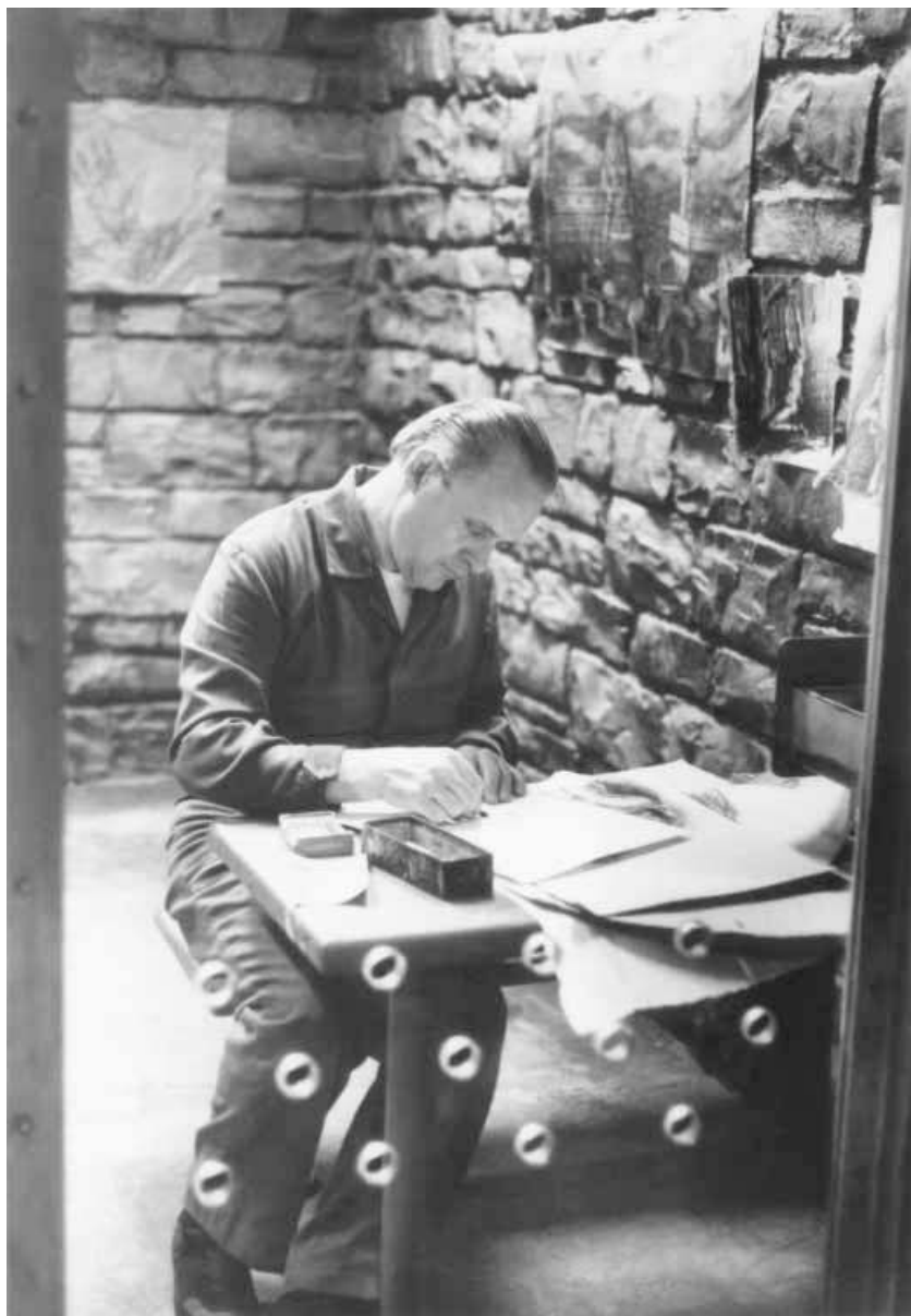
2. The Silence of the Lambs : A police film that is also a study of a monstrous criminal. (Anthony Hopkins)