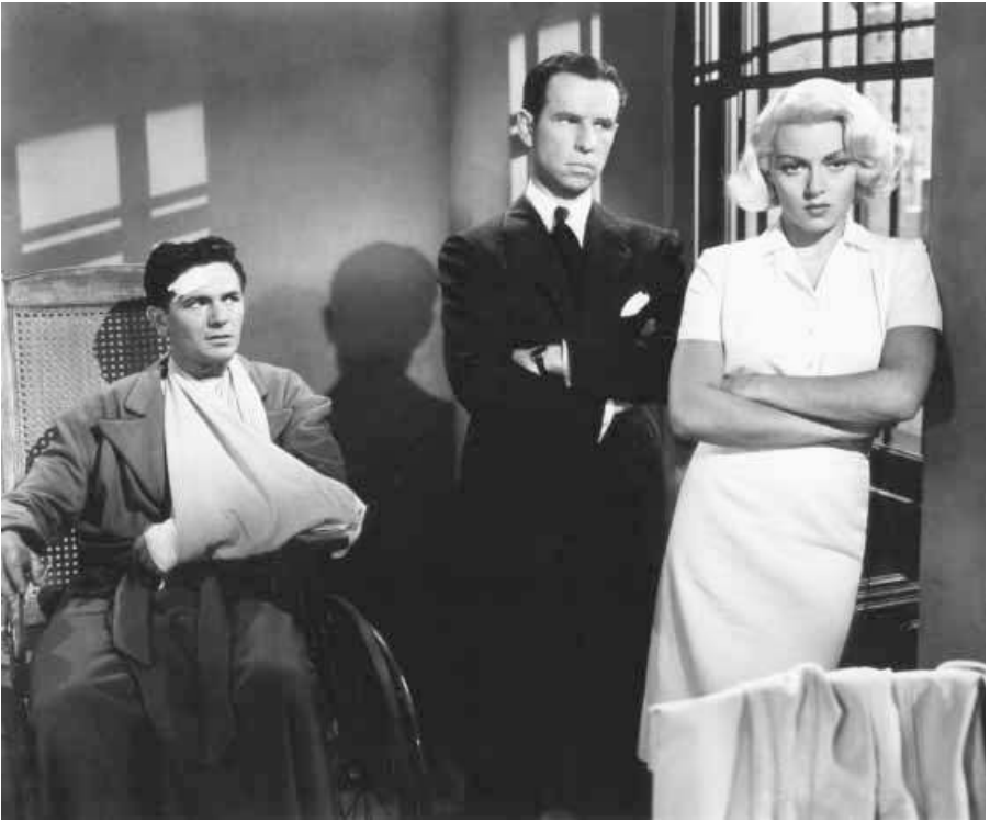
15. The Postman Always Rings Twice (1946): Is the hero destroyed by the femme fatale, or by his own weakness? (John Garfield, Hume Cronyn, Lana Turner)

corded to the femme fatale is a function of fears linked to the notions of uncontrollable drives, the fading of subjectivity, and the loss of conscious agency.” 54 James F. Maxfield is still more explicit: “The internal conflicts of the male protagonists are ultimately more important than external conflicts with other characters – even with the fatal woman. . . . The women are merely catalysts; in the end it is the men who are destructive to themselves” 55 [Fig. 15]. And Richard Dyer contends that “film noir is characterized by a certain anxiety over the existence and definition of masculinity and normality” – an anxiety that, since it cannot be expressed directly (for such a direct expression would admit the existence of the very problem it is the films’ work to obscure), is marked by the threatening predominance of nonmasculine images to indicate the boundaries of categories that cannot be constructed in positive terms. 56