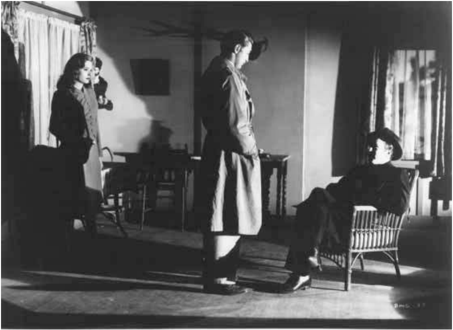
14. Out of the Past : Antitraditional mise-en-scène expressing a grim, romantically stylized view of the world. (Jane Greer, Robert Mitchum, Steve Brodie)

The defining presence of a detective hero had made the detective film seem less problematic from the beginning. Considering the formulaic nature of detective fiction, it was eminently predictable that its conventions would attract the attention of Tzvetan Todorov, the first-generation structuralist most interested in popular forms.