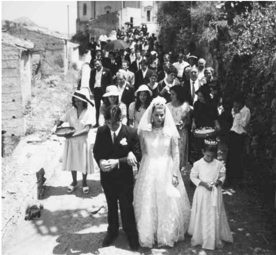
26. The Godfather : Michael's first marriage as an abortive attempt at happiness. (Al Pacino, Simonetta Stefanelli)

chael abruptly marries Kay – their wedding, unlike his and Apollonia's, is never shown – after a single, chillingly dispassionate courtship scene. If his first marriage was an attempt at personal happiness and self-fulfillment [Fig. 26], his second is a marriage of convenience, an assimilationist fantasy evidently designed to bring him a step closer to his oft-proclaimed dream of making the Corleone family legitimate.