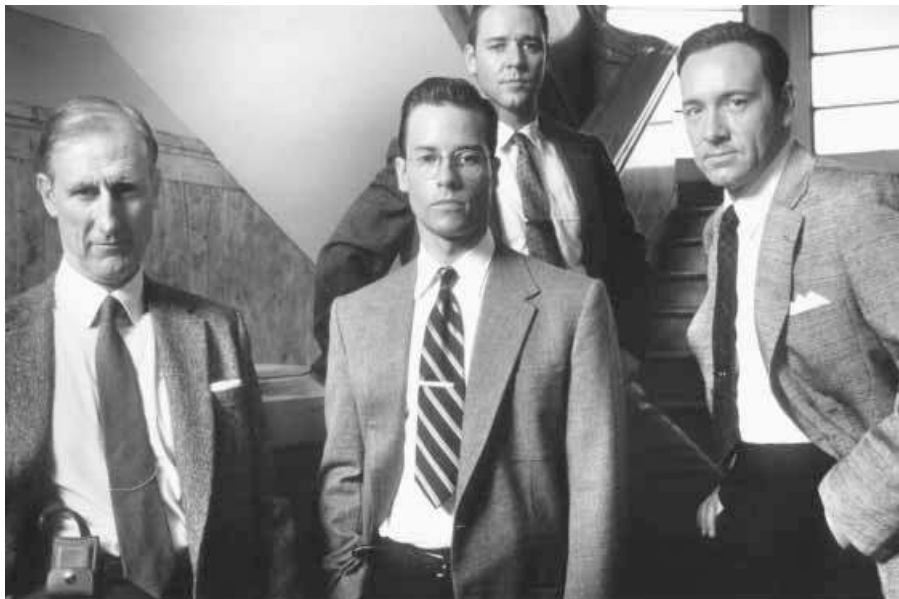
50. L.A. Confidential : An ill-assorted police team (James Cromwell, Guy Pearce, Russell Crowe, Kevin Spacey) that has not yet begun to work as a team.

law's powerlessness, the weakness of the authority that gives it moral and legal force, and the resulting lawless chaos; the final resolution reflects their confidence in the law and the justice of its tactics, however violent, even lawless, they may seem. It is a primary task of police films to mediate between these two attitudes, expressing audiences' skeptical fears about the justice system while leaving them ultimately confident in its workings.